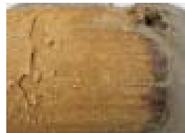
Figure 4. Ultra Spacer/ Cement

The Ultra Spacer system successfully plugged off all three-slot sizes and plugged off the sand bed layer. In addition it allowed for the cement slurry to not have fluid loss and dehydrate thus maintaining an uncompromised cement sheath.