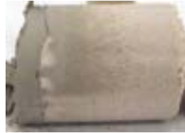
Figure 2. Neat Cement

The low-pressure fluid loss tests across the sand bed demonstrated the ability of the Ultra Spacer® system to seal itself off against a formation. Figure 2 shows the neat cement system penetrating throughout the sand layer. The cement system had no fluid loss control and penetrated the sand layer within seconds resulting in a completely de-hydrated layer of cement on top of the sand layer. Figure 2 shows the Ultra Spacer® under the same conditions, only penetrating a very small amount into the sand layer. A low permeability membrane is created across the formation, resulting in retention of the Ultra Spacer system on top of the sand layer. This excess of Ultra Spacer® is then removed from the test fixture and the neat cement system is placed on top of the sand layer containing the Ultra Spacer® membrane. Figure 4 shows the neat cement system not being allowed to penetrate past the Ultra Spacer membrane. There is no fluid lost to the sand layer by the cement system.