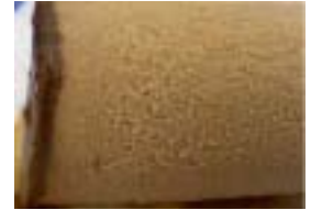
Figure 3. Ultra Spacer®